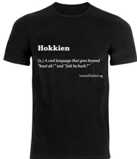
Hokkien Definition · Black