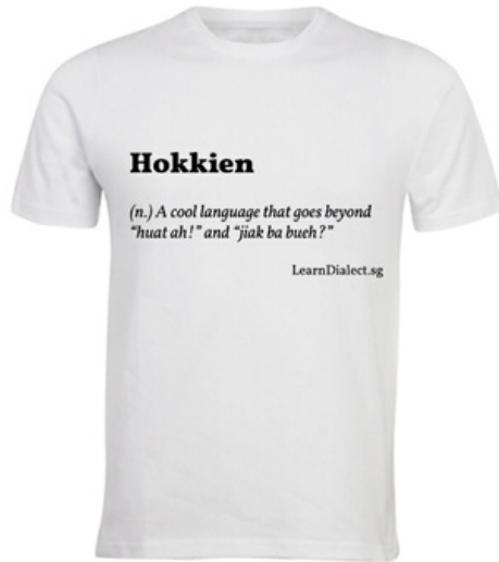
Hokkien Definition · White

... goes beyond "huat ah!" and "jiak ba bueh?"