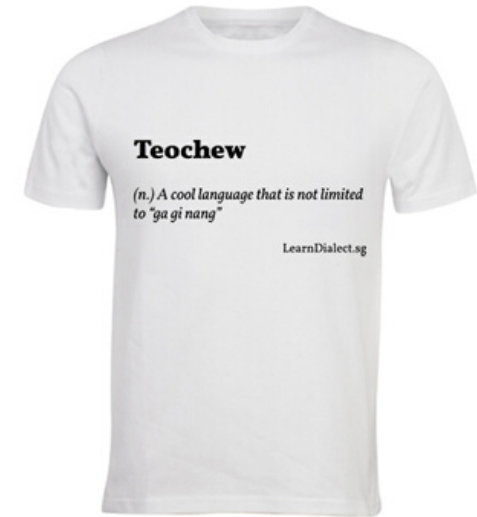
Teochew Definition · White