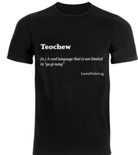
Teochew Definition · Black