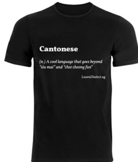
Cantonese Definition · Black