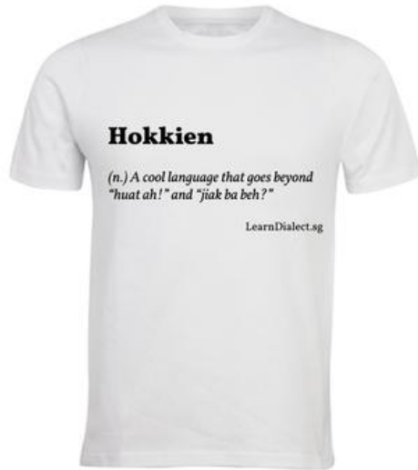
Hokkien Definition · White

... goes beyond "huat ah!" and "jiak ba beh?"