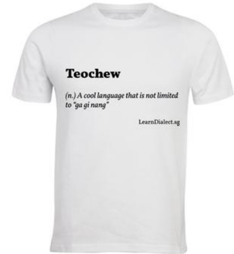
Teochew Definition · White