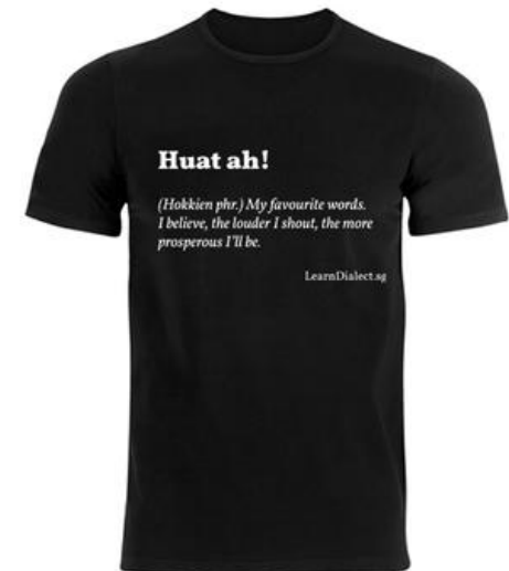
"Huat ah!" Definition · Black