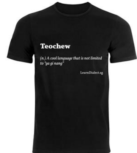
Teochew Definition · Black