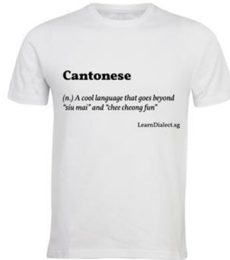
Cantonese Definition · White

... goes beyond "siu mai" and "chee cheong fun"