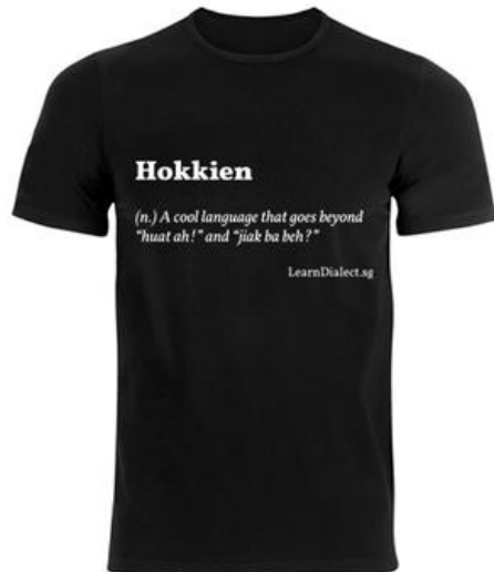
Hokkien Definition · Black