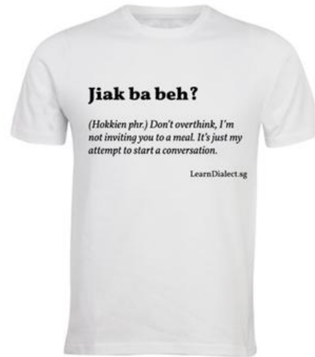
"Jiak ba beh?" Definition · White

Don't overthink, I'm not inviting you to a meal. It's just my attempt to start a conversation.