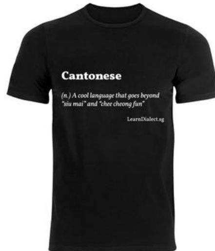
Cantonese Definition · Black