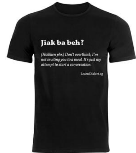
"Jiak ba beh?" Definition · Black

My favourite words. I believe, the louder I shout, the more prosperous I'll be.