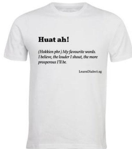
"Huat ah!" Definition · White

My favourite words. I believe, the louder I shout, the more prosperous I'll be.